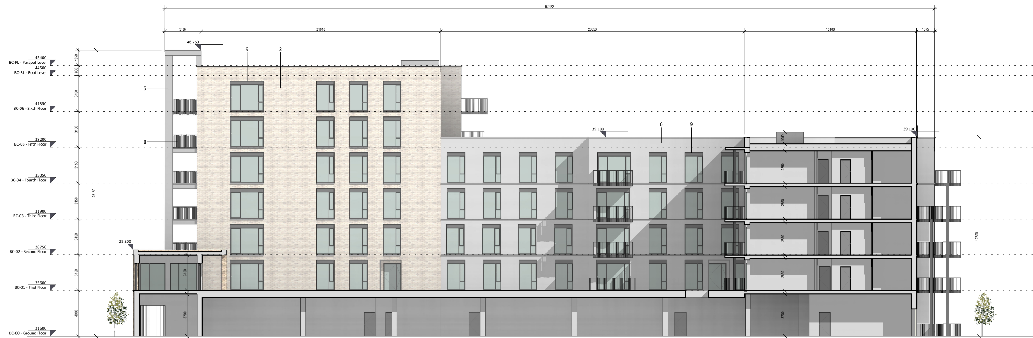
1 BC-North Section/Elevation through Courtyard 1: 200