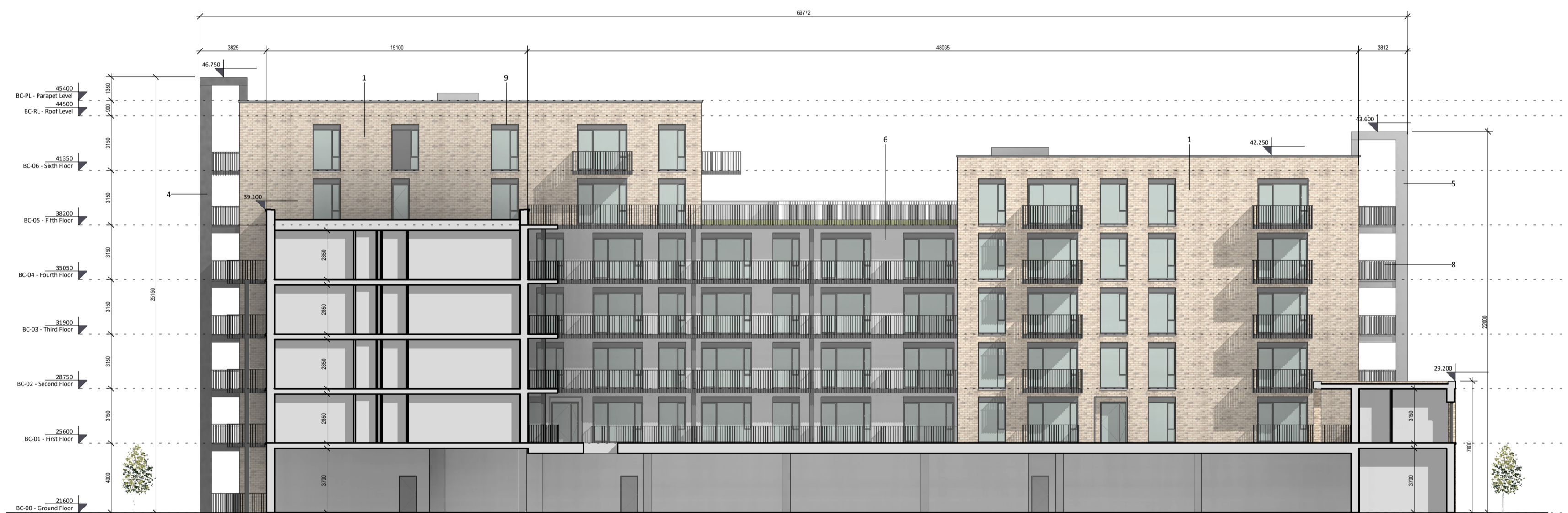
2 BC-South Section/Elevation through Courtyard 1: 200